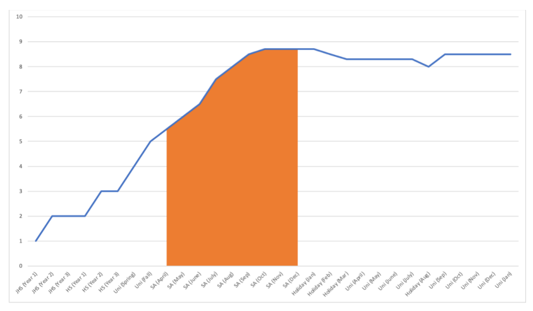
Fig. 2. Haru's CTS graph

In contrast to Ruika's rollercoaster, Haru plotted a stable, gradual upward trajectory that was always positive. Despite this perception, interviews revealed that Haru faced dips in her CTS as she faced challenges in new situations.